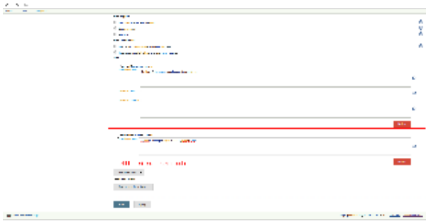
commit build step configuration